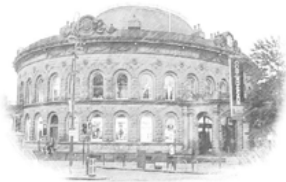
Flavour Map Number: 2

Corn exchanges are buildings across the UK where merchants traded corn. Bourbon is made of 51% corn so this a bourbon forward cocktail served over an ice ball that replicates the exchanges dome.