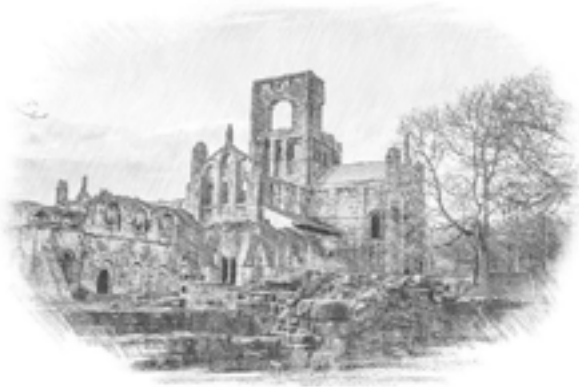
Flavour Map Number: 1

Kirkstall Abbey was a Cistercian monastery and is full of history, this is a strong and herbal cocktail that matches that heritage. Benedictine being the star of the show as it was released to the world 8 years before the monastery was disestablished.