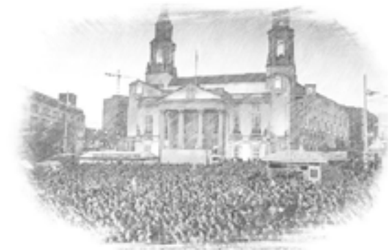
Flavour Map Number: 10

Millennium Square was created as part of the millennium foundation and was the place to go in Leeds to see in the year 2000. Take your Sky Lounge experience to the next level with this ultimate celebration cocktail.