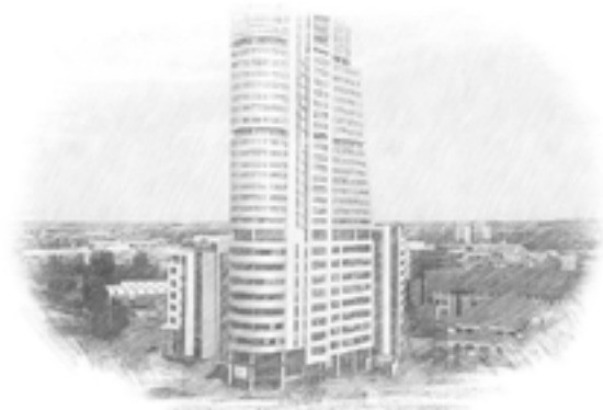
Flavour Map Number: 19

The highest building in Yorkshire, Bridgewater place is a modern icon. We wanted to celebrate some of Yorkshire's best, using two local gins, the flavour of rhubarb and the best tea in the world! Sit back and enjoy this refreshing sharing cocktail