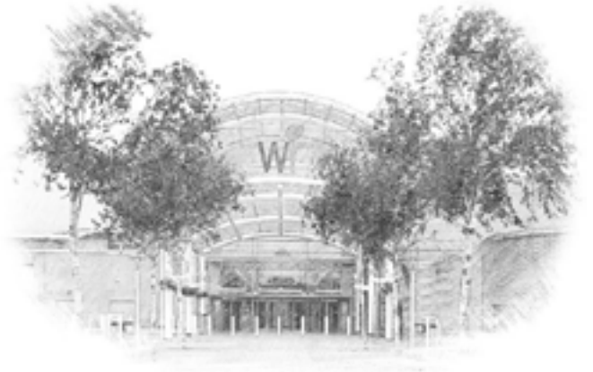
Flavour Map Number: 18

The White rose is the symbol of Yorkshire and has a shopping centre named after it. This cocktail combines Tanqueray flor de Sevilla and Yorkshire Tea syrup and has been topped with a home made rose foam. This really is a special match for Yorkshire's iconic emblem.