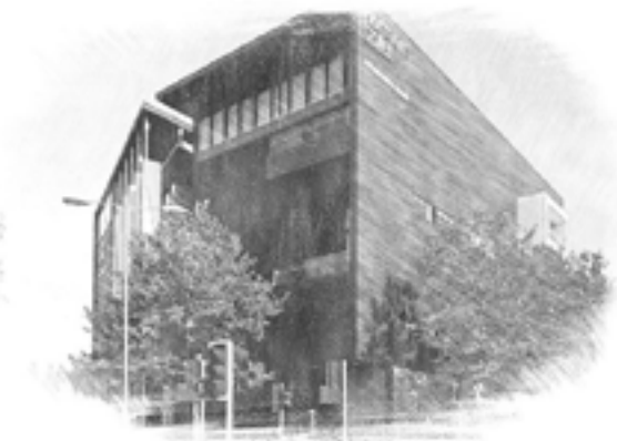
Flavour Map Number: 13

Northern Ballet is a dance company based in Leeds with a classy and sophisticated reputation and this cocktail is exactly that. Bringing together a local rhubarb gin and champagne, you wouldn't feel out of place at the ballet with this.