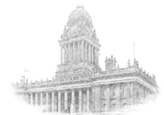
Flavour Map Number: 12

Tanqueray No. Ten Chambord Cranberry Silver Lime Sugar syrup